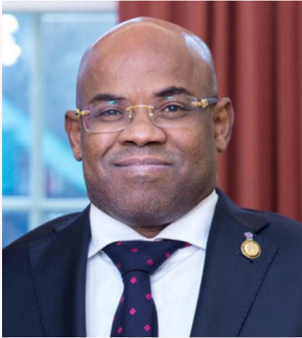
H.E. Amb. Mohamed Siad Doualeh

Permanent Representative of the Republic of Djibouti to the United Nations and the Ambassador of the Republic of Djibouti to the United States.